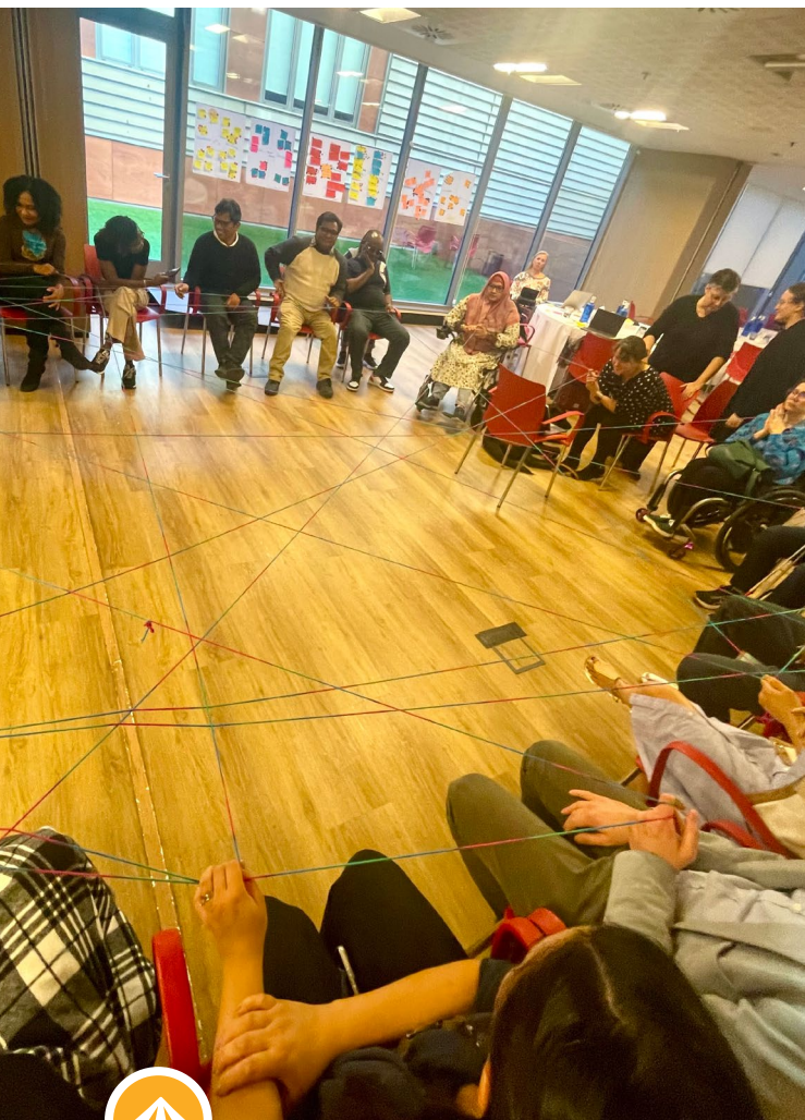
DRF staff members at a team retreat in Barcelona.