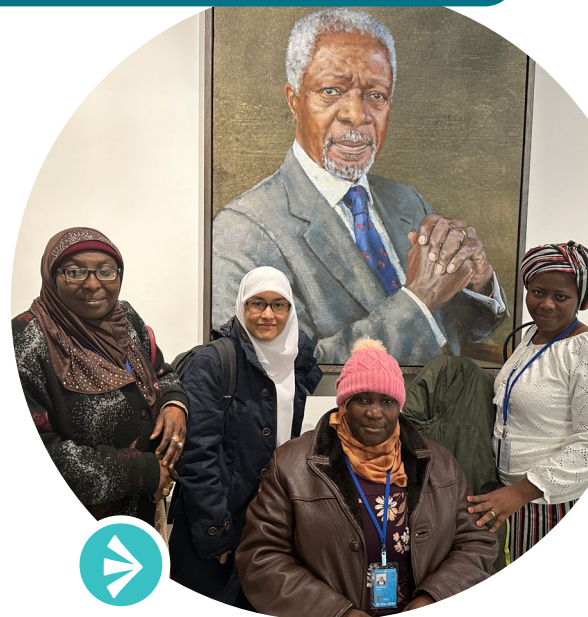
Intersectional feminist activist cohort at CSW 68.